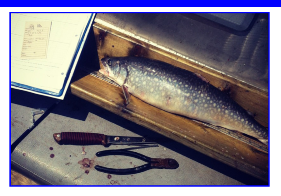
A Lake Trout about to be sampled during the Fish Community Index Netting study.