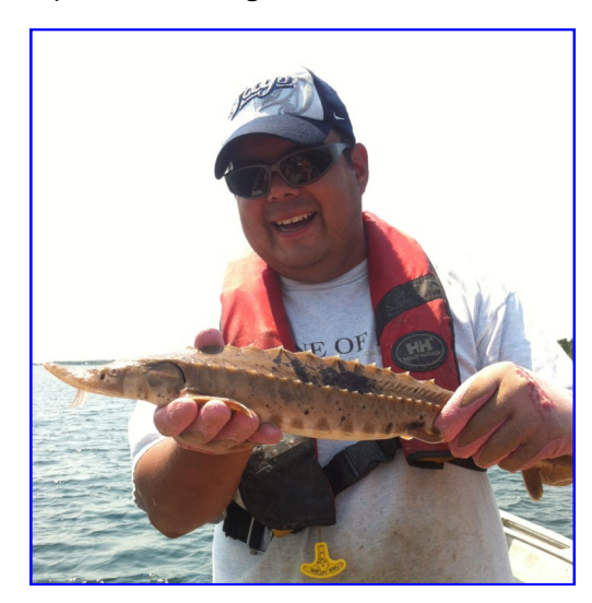
A juvenile Lake Sturgeon was one of the catches in Sheshegwaning.

A full technical report is currently being drafted and will be finalized in 2013. Data from 2012 will be compiled and compared to existing North Channel data.